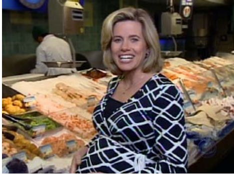
Fish and shellfish are an important part of a healthy diet.