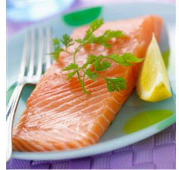
Salmon is lower in mercury, and also very tasty